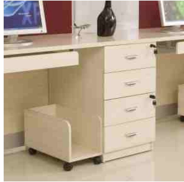
WORK STATION CABINETS